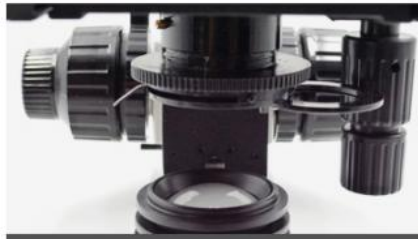
Abbe Condenser N.A.1.25

High brightness 1W LED, brightness adjustable, with internal rechargeable batteries and external 100-240V battery charger/mains adapter.