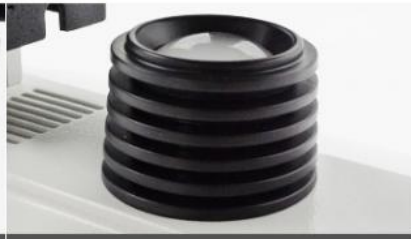
Light Source Collector