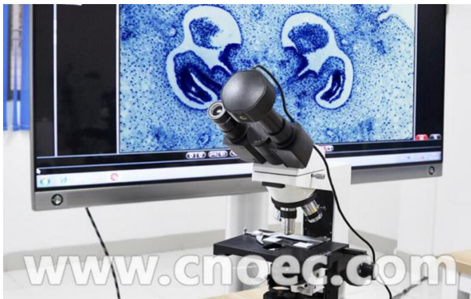
A59.4910 Digital Camera, 5.0M, 720p, C Mount