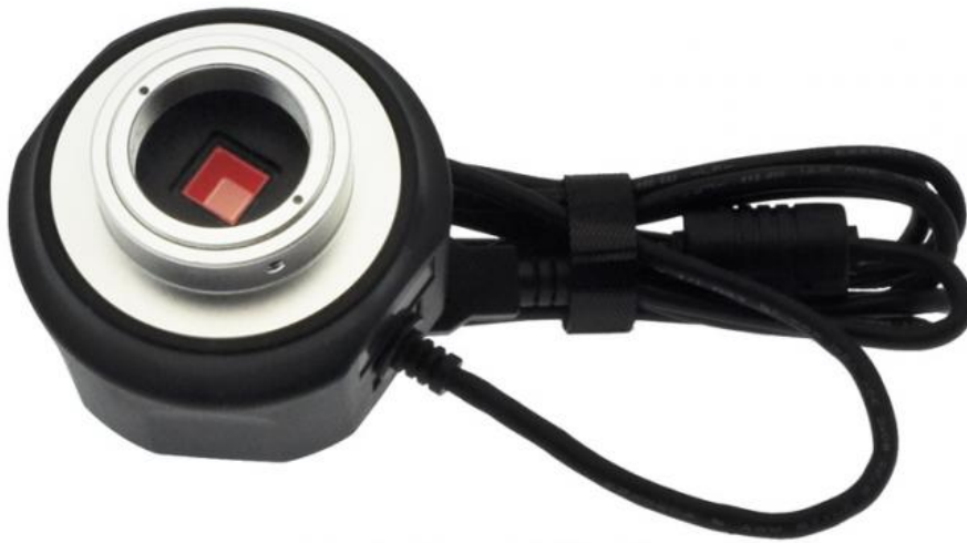
A59.4910 Digital Camera, 5.0M, 720p, C Mount