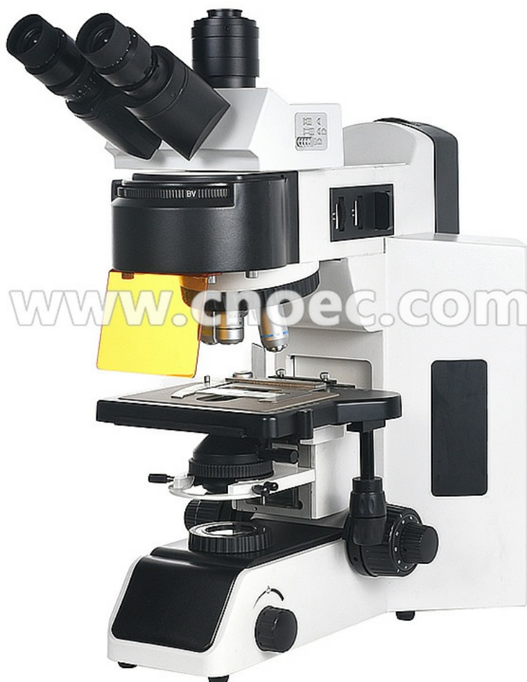
A16.4501 LED Fluorescent Microscope, 5 Brand, G,B,BV,V,U