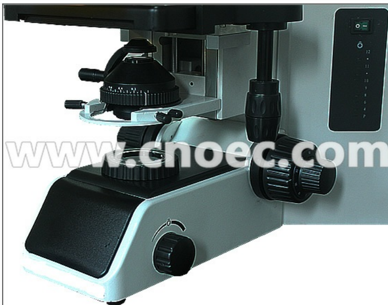
Swing-out Abbe Condenser N.A.1.25 With Iris Diaphragm, Height, Center Adjustable Transmitted Illumination, 5W LED, Brightness Adjustable Brightness Indicator, Field Diaphragm