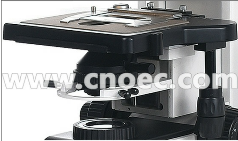
Rackless, Double Layer Mechanical Stage 180x150mm / 75x50mm, With Ceramic-coated Surface, Coaxial XY Moving adjustment Konb