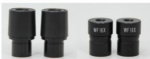
WF10X/18mm & WF16X/11mm