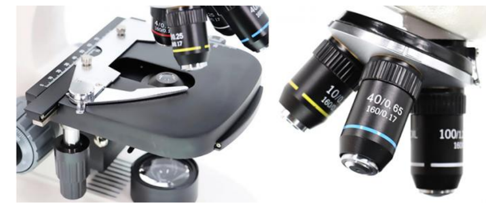
Double Layer Mechanical Stage for A11.1002-B/C