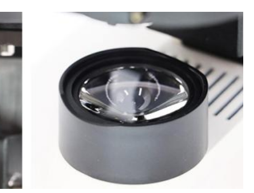
S-LED Illumination, Brightness Adjustable