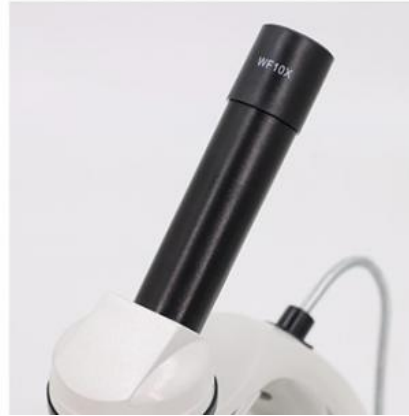
A11.1020-M Monocular Head