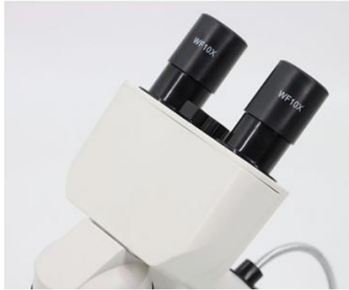
A11.1020-B Binocular Head