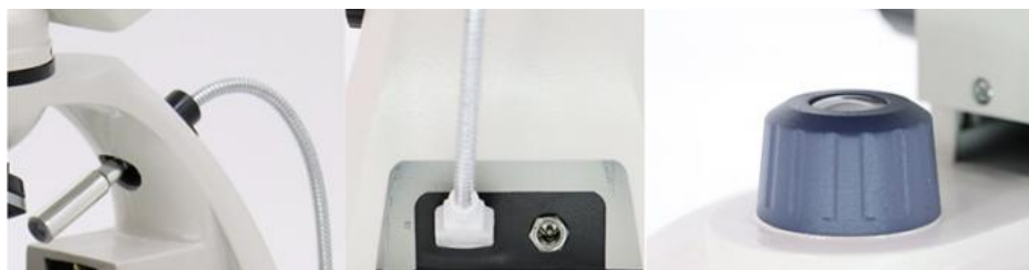
Upper Flexible LED, Bottom LED Brightness Adjustable