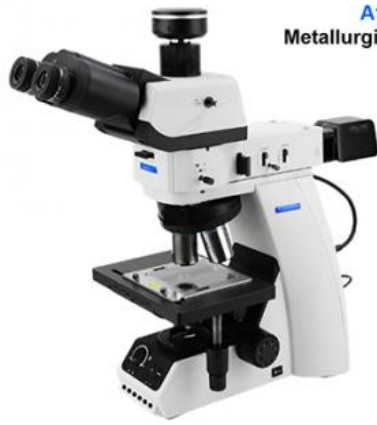
A13.2220 Metallurgical Microscope