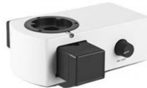
Reflect Fluorescent Illuminator