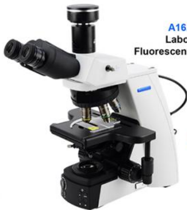
A16.2220 Laboratory Fluorescent Microscope