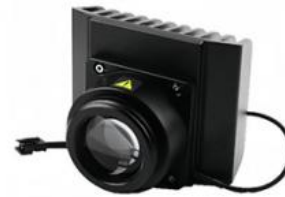
Ultra High Power and Wide Spectral White LED Light Source