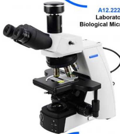
A12.2220 Laboratory Biological Microscope