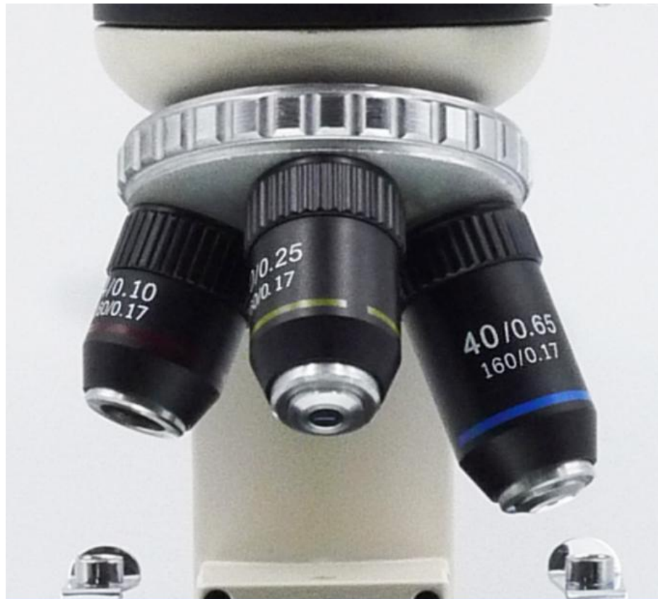
Strain-free Achromatic Objective 4x,10x 40x(S)