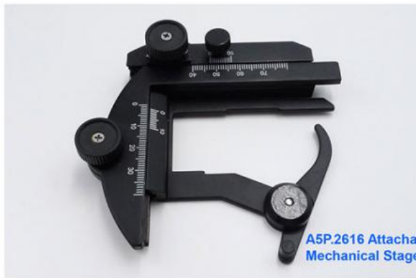
A5P.2616 Attachable Polarizing Mechanical Stage, Moving Range 40x40mm