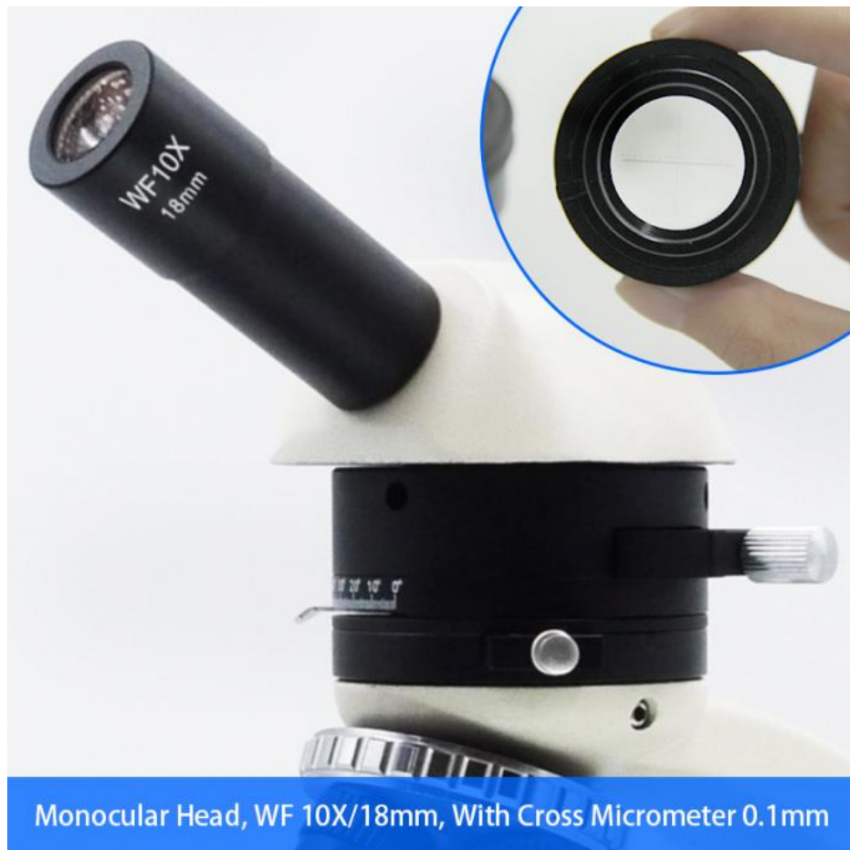
Monocular Head, WF 10X/18mm, With Cross Micrometer 0.1mm