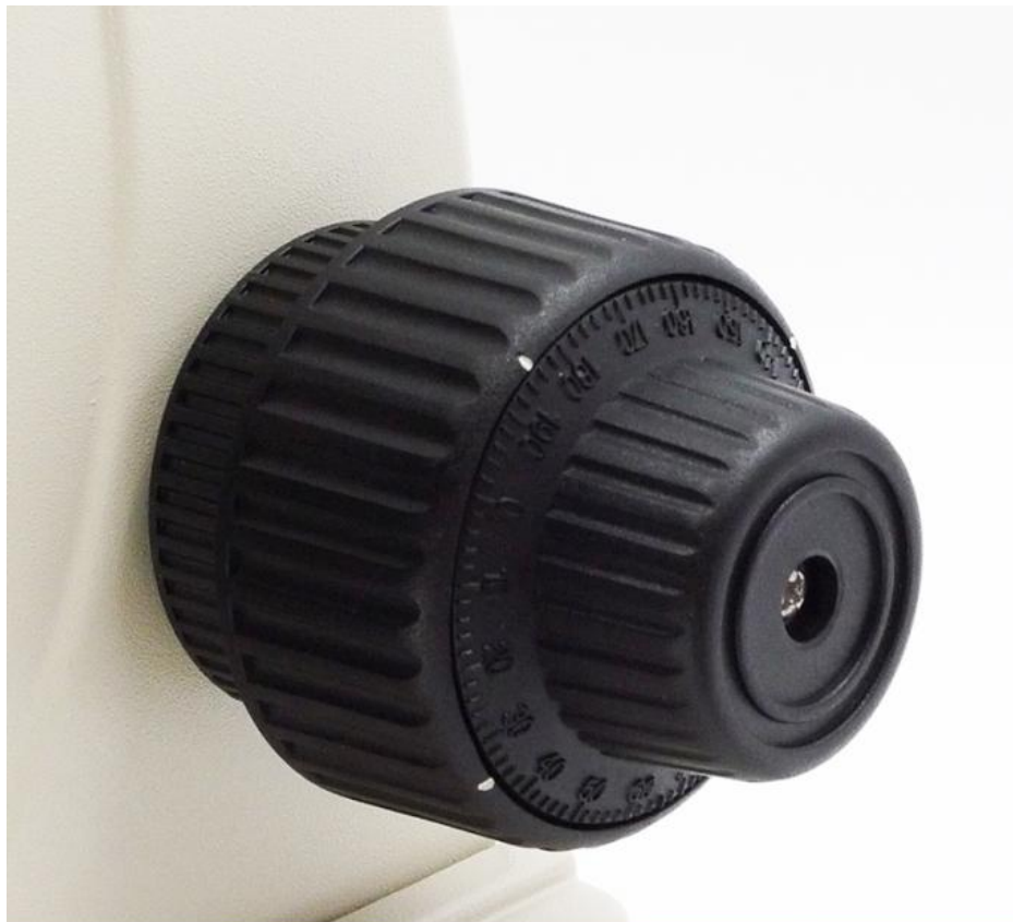
Coaxial Coarse & Fine Focusing