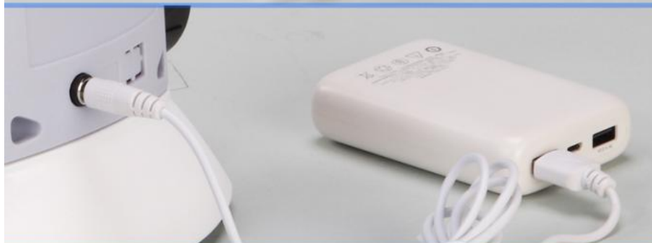
Powered By Safety Low Voltage Charger, Input Wide Voltage 100V-240V, Output 5V1A, Support Power Bank Supply For Outdoor Use

Input Wide Voltage 100V-240V, Output 5V1A, Support Power Bank Supply For Outdoor Use