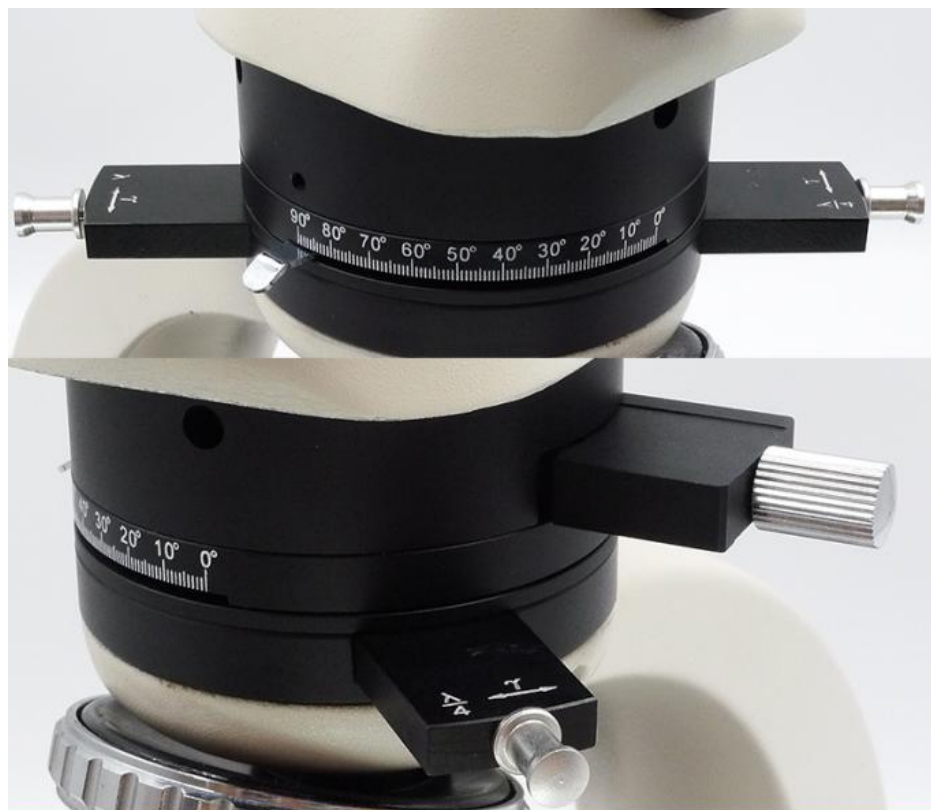
Analyzer Unit, 0-90° , It Can Be Moved Out Of The Optical Path For Single Polarizing Observe

Monocular Head, Inclined 30°, Rotatable 360° WF 10X/18mm, With Cross Micrometer 0.1mm