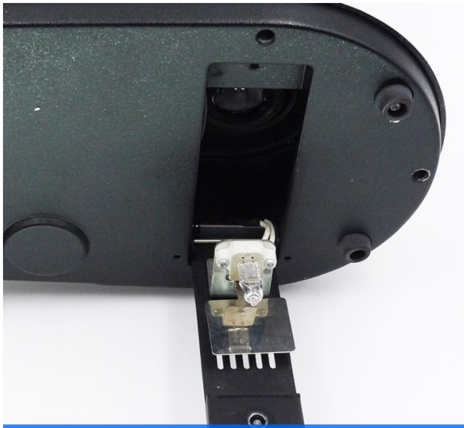
12V/20W Halogen Lamp