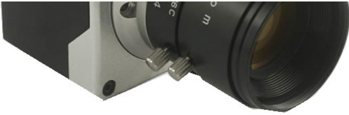
The Lens Is Optional