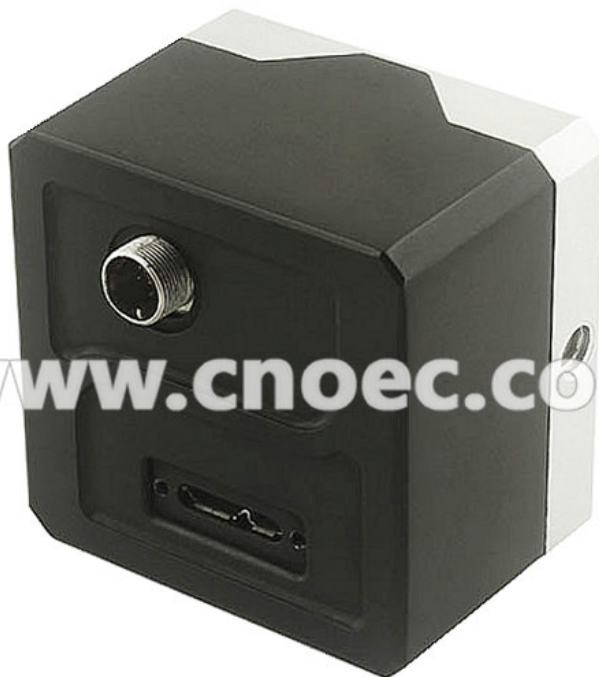
A59.3515 Digital Camera, USB 3.0, 16MP