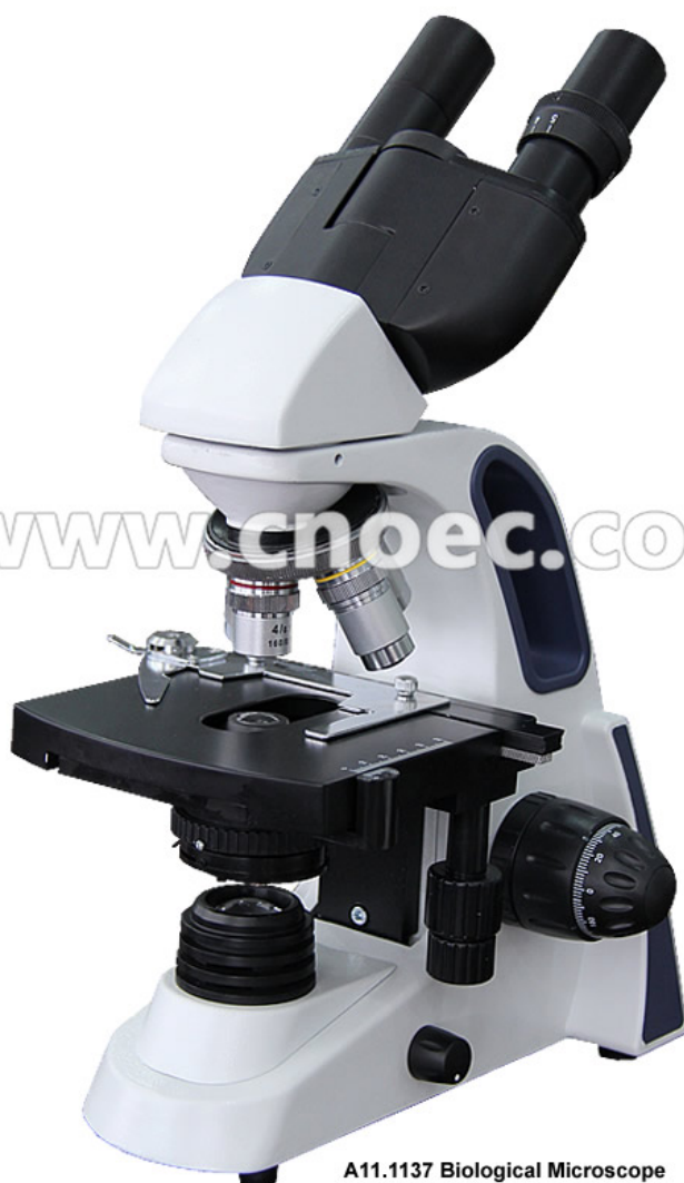
A11.1137 Biological Microscope