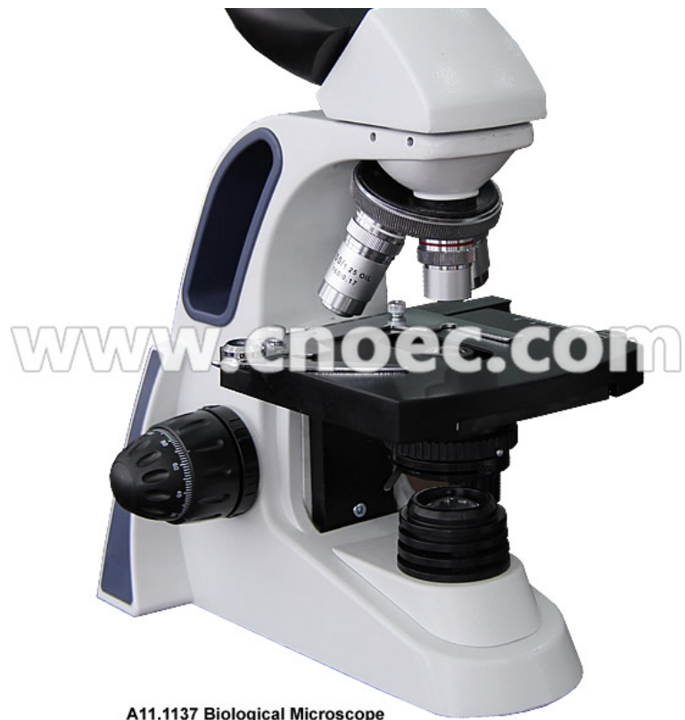
A11.1137 Biological Microscope