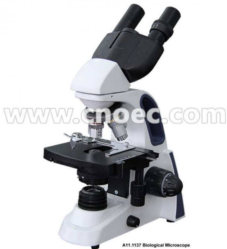
A11.1137 Biological Microscope