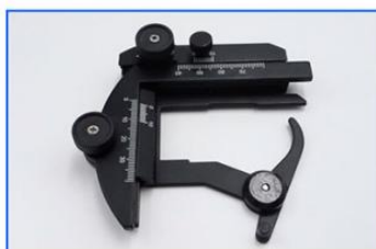
A5P.2616 Attachable Polarizing Mechanical Stage, Moving Range 40x40mm