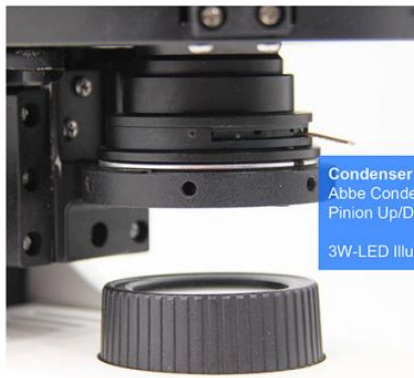
Condenser & Light Source Abbe Condenser N.A.1.25, Iris Diaphragm, Rack & Pinion Up/Down, With Filter Holder 3W-LED Illumination Systems