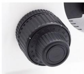
Coaxial Coarse & Fine Focusing