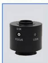
A55.2601-05 C-Mount 0.5x Focus Adjustable