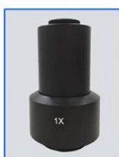
A55.2601-10 C-Mount 1.0x Focus Adjustable