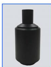
A55.2610 Digital Eyepiece Camera Adapter Dia. 23.2mm/25mm