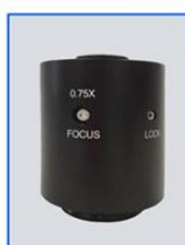
A55.2601-75 C-Mount 0.75x Focus Adjustable