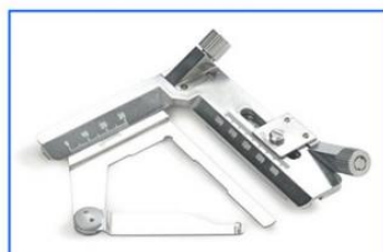
A5P.2616-LK Attachable Mechanical Stage, Lecia Type