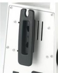
Wire Winding Device