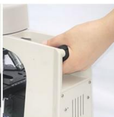
Holding Hole On Back

Powered By Safety Low Voltage Charger Input Wide Voltage 100V-240V, Output 5V1A, Support Power Bank Supply For Outdoor Use