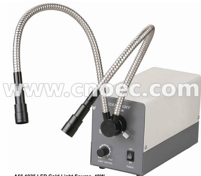
A56.1025 LED Cold Light Source, 40W