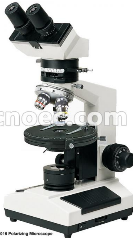
A15.1016 Polarizing Microscope

Polarizer, Sliding In/Out of Optical Path, On Top Of Collector