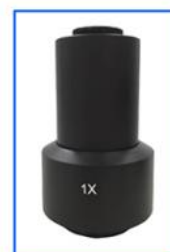
A55.2601-10 C-Mount 1.0x, Focus Adjustable