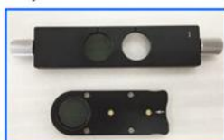
A5P.2603-BS Analyzer + Polarizer