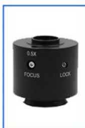
A55.2601-05 C-Mount 0.5x, Focus Adjustable