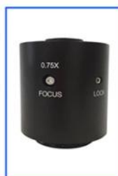
A55.2601-75 C-Mount 0.75x, Focus Adjustable