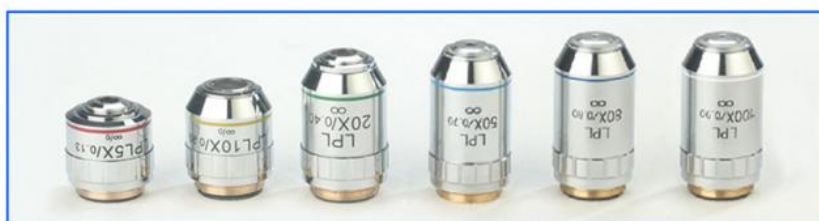
A5M.2633 Metallurgical LWD Infinity Plan Objectives