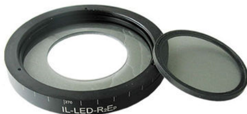
A56.2102-PL Polarizing Kit

for more products please visit us on cnoec.com