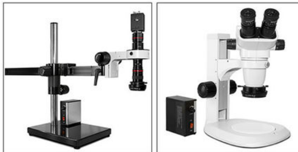
A56.2102-2 LED Lamp for Normal Stereo Microscope