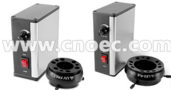
A56.2102-1 LED Lamp for Mono Zoom Video Microscope