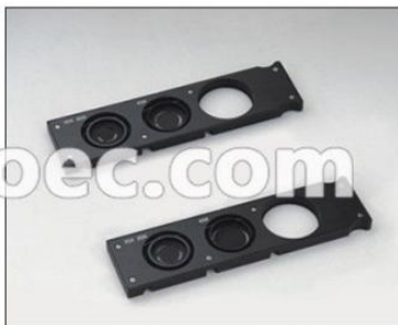
Phase Contrast Slides Used With Phase Contrast Objectives, Can Get A Better Image Than Bright Field, The Cell Image Is With A Strong Sense Of Relief.