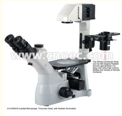
A14.0900-B Inverted Microscope, Trinocular Head, with Kohler Illumination