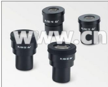
New Designed High Eye-point Wide Field Plan Eyepiece PL10x/22mm, Has Full Bright Diagram Without Chromatic Circle. Wide Filed of Viewing 22mm Is Convenient For Target Seeking And Counting