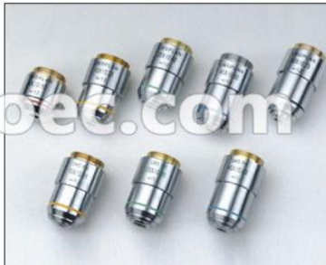
OLIP Series Long Working Distance Infinity Color Corrected Objectives, Designed For Living Cells Culture In Laboratory, Clear Image, Good Contrast And Nice For Fluorescence Observation