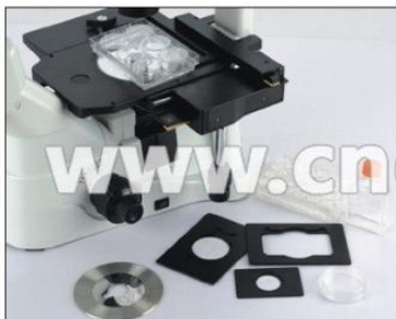
Moving Stage 120*78mm, Can Clamp Different Types Of Standard Cell Culture Plates. With The Help Of Related Accessories, It Could Be Used To Move Dish, Flask, Slide And So On.