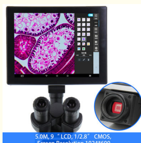
5.0M, 9" LCD-172.8" CMOS, Screen Resolution 1024*600