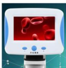
4.3" HD LCD 2.0M Digital Camera