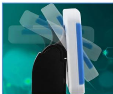
LCD screen 45° tiltable, ergonomic design to meet observations from different directions easily.