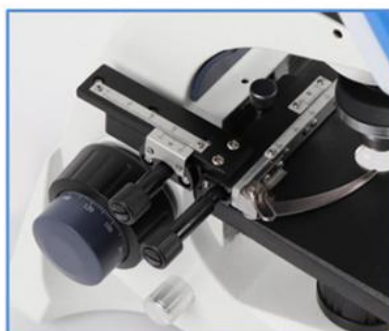
X/Y axes moving ruler can quickly & accurately move the specimen into the viewing field