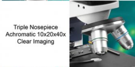
Triple Nosepiece Achromatic 10x20x40x Clear Imaging