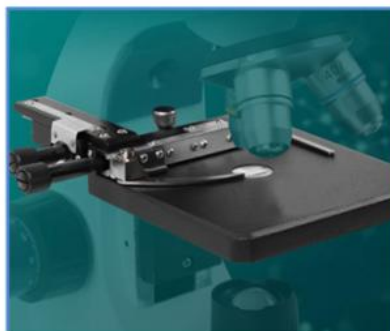
Vernier scale stage, with single lens condenser, with disc diaphragm & different color filters.