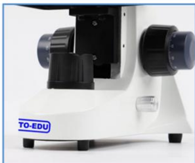
Elegant smooth design, heavy metal base supply steady stand for firm view.