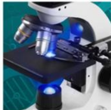
Dual Light Up/Bottom LED