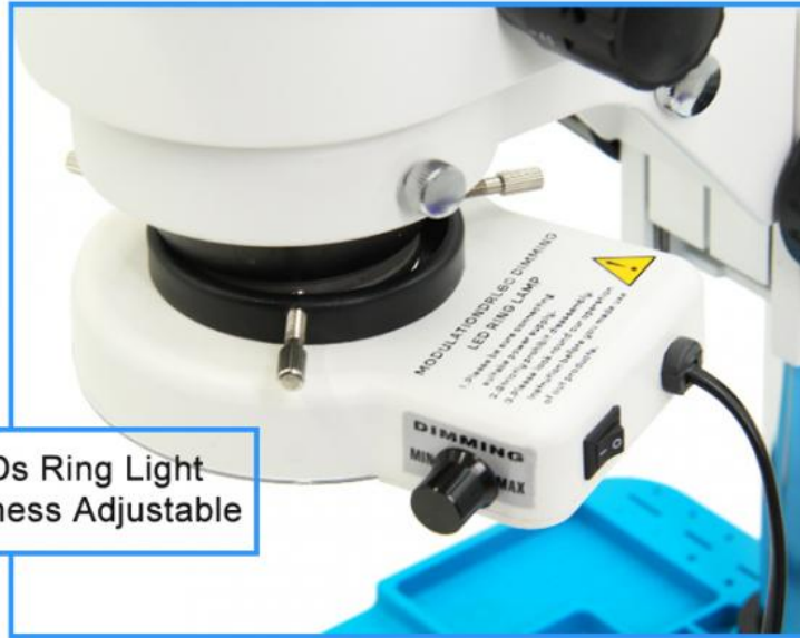
56 LEDs Ring Light Brightness Adjustable