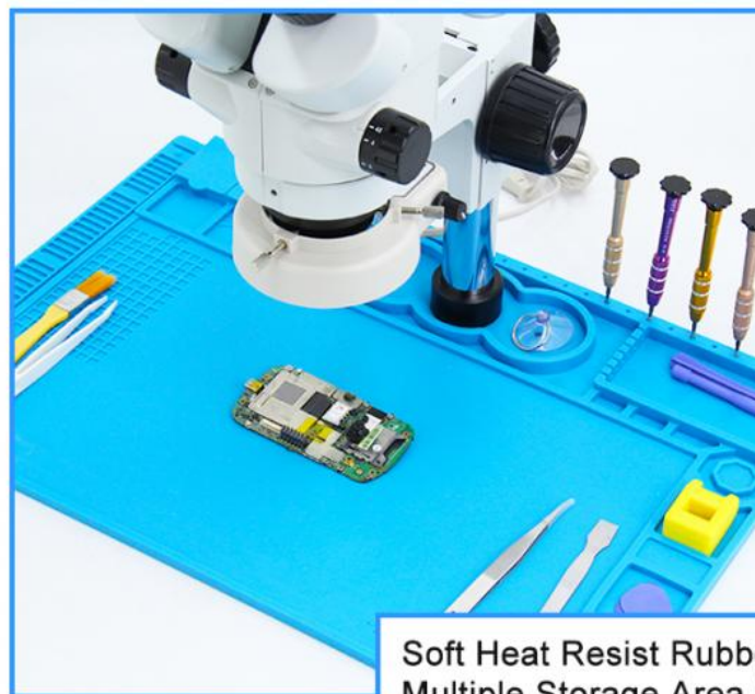
Soft Heat Resist Rubber Pad Multiple Storage Area For Tools