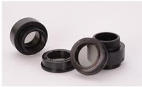
Polarizing Light Lens Set