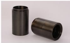
0.4x Auxiliary Lens