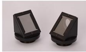
Coaxial Light Attachment