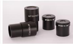
WF10x & WF20x