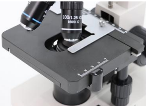
Double Layer Mechanical Stage