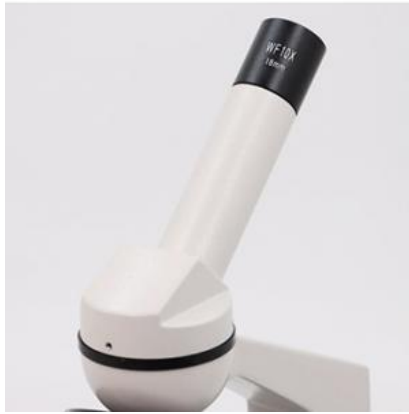
A11.1009-D Monocular Head