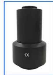
A55.2601-10 C-Mount 1.0x, Focus Adjustable