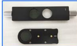
A5P.2603-BS Analyzer + Polarizer