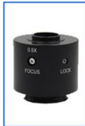
A55.2601-05 C-Mount 0.5x, Focus Adjustable