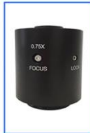
A55.2601-75 C-Mount 0.75x, Focus Adjustable