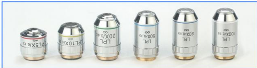
A5M.2633 Metallurgical LWD Infinity Plan Objectives