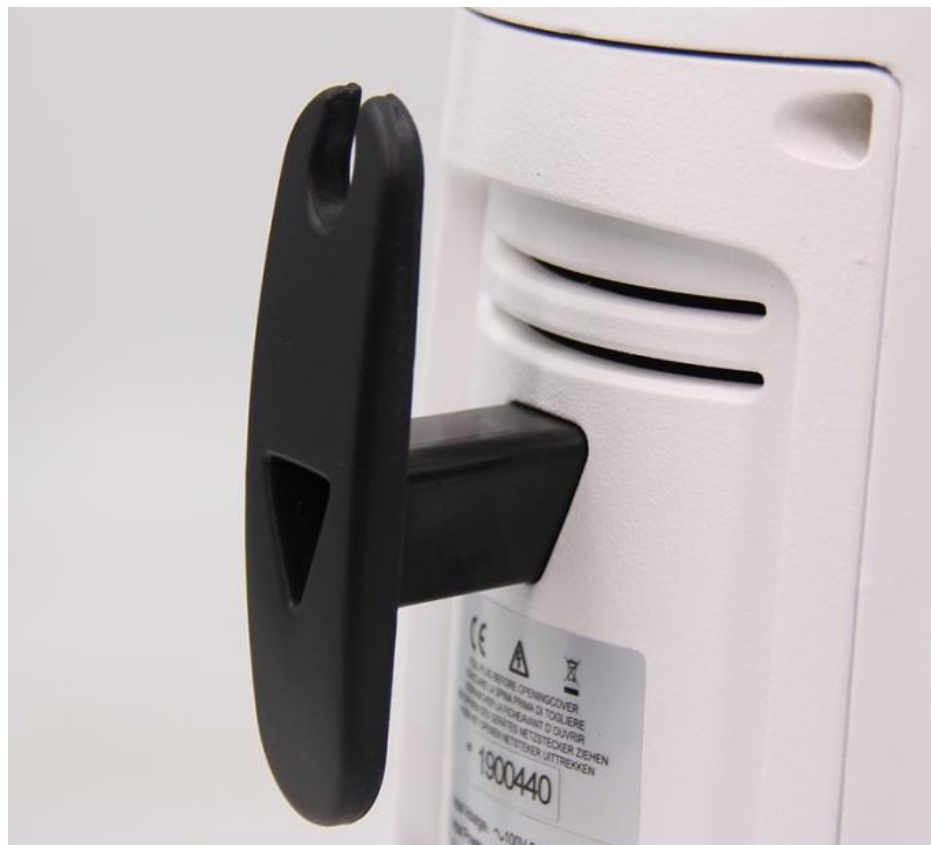
Wire Winding Device

For Easy Handling And Storage; You Can See The Change Of Objective Magnification Even From The Back