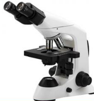
A12.6603-B + Rackless (Integrated) Stage