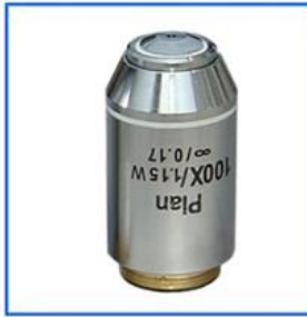
A52.2606-100W 100x Water Objective