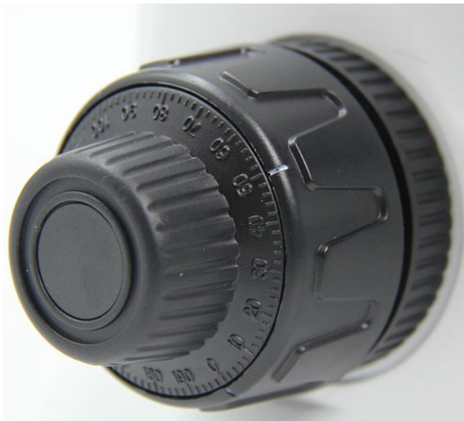
Coaxial Coarse & Fine Focusing