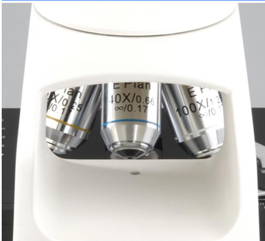
Observation Window At The Rear Of The Body