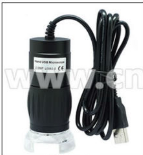
USB 2.0 interface