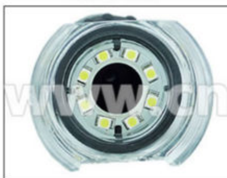
Built-in 8pcs LEDs