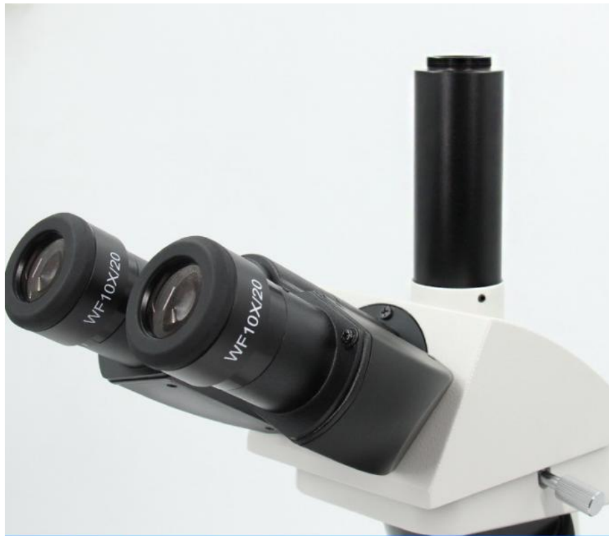
Seidentopf Trinocular Head, 30° Inclined, 360° Rotatable, Interpupillary 48~75mm, Wide Field WF10x/20mm, Dia.30mm