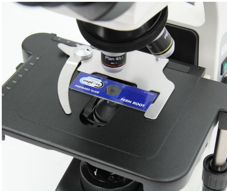
Double Layer Mechanical Stage, 216x150mm, Moving Range 54x78mm, Double Slide Holder, Low Position X/Y Coaxial Control Knob, With Travel Guide To Avoid Scratch