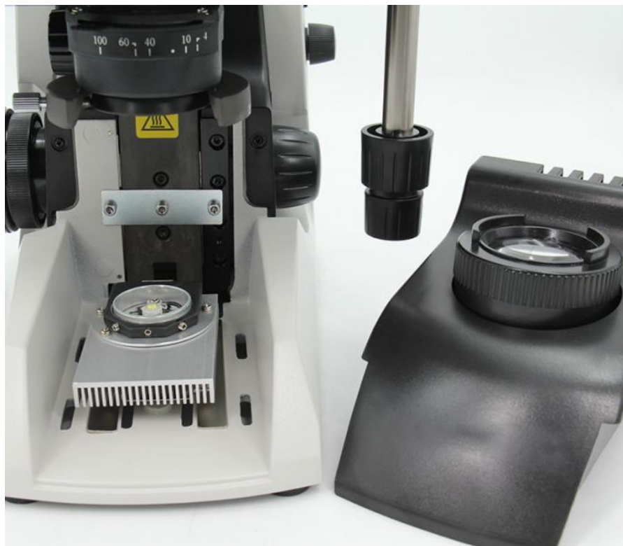
Halogen Lamp 12V/20W, Brightness Adjustable Light Source Cover Removable For Easy Repair