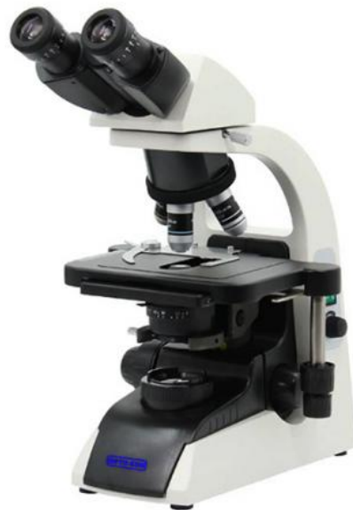
A12.1010-A Binocular, Quadruple Laboratory Biological Microscope