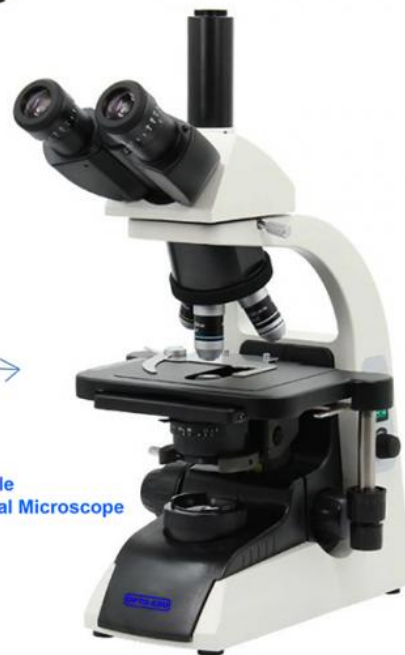
A12.1010-B Trinocular, Quadruple Laboratory Biological Microscope