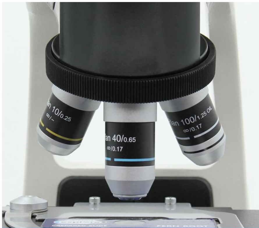
Backward Quadruple Nosepiece, With Infinity Plan Achromatic 4x/0.10, 10x/0.25, 40x/0.65(S), 100x/1.25(S,Oil)