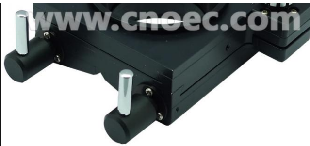
Optional Part: A54.2501 Magnet Stand