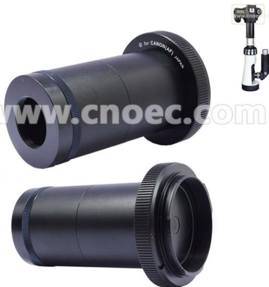
A55.2502 Canon SLR Camera Adapter