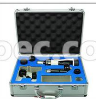
Portable Aluminum Case