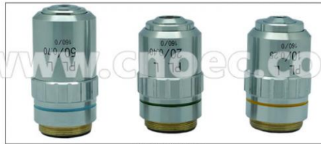
LWD Plan Objective