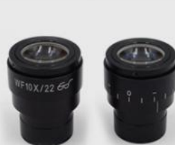
WF10x/22mm, Diopter Adjustable