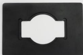
Petri Dish Holder Dia.54mm