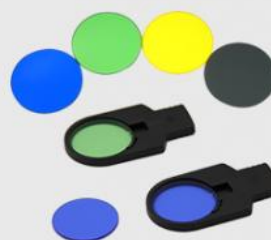
Filter Holder, Filter Blue, Green, Amber(Optional), Grey(Optional)