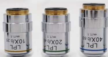
A52.2608 LWD Infinity Plan Objective LPL4x/0.11, WD=12.1mm(Optional) LPL10x/0.25 WD=8.3mm LPL20x/0.40 WD=7.2mm LPL40x/0.60 WD=3.4mm