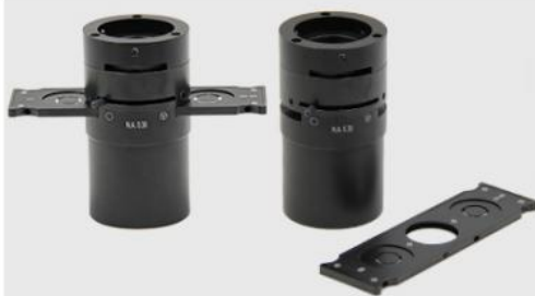
Phase Contrast Annular Plate For 20x/40x