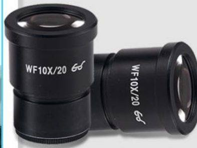
○ Eyepiece WF10X/20mm

○ 0.67x-4.5x, Magnification Up To 3.35x-270x With Optional Eyepieces And Auxiliary Objectives